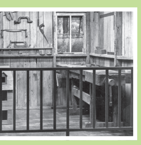
With the decrease in staff and resources, many donors requested their items be returned to them.